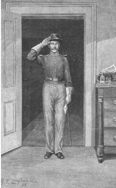
"A cavalry orderly makes his appearance at the door"